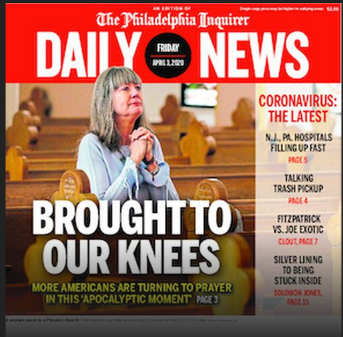
THE DAILY NEWS